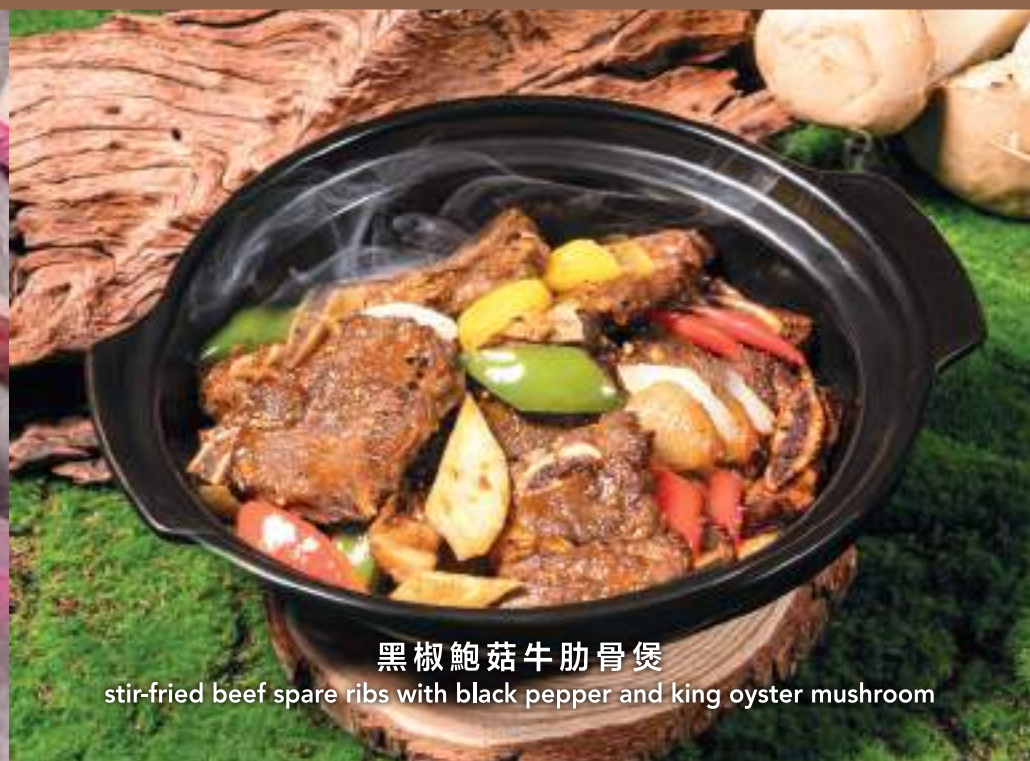
黑椒鮑菇牛肋骨煲 stir-fried beef spare ribs with black pepper and king oyster mushroom