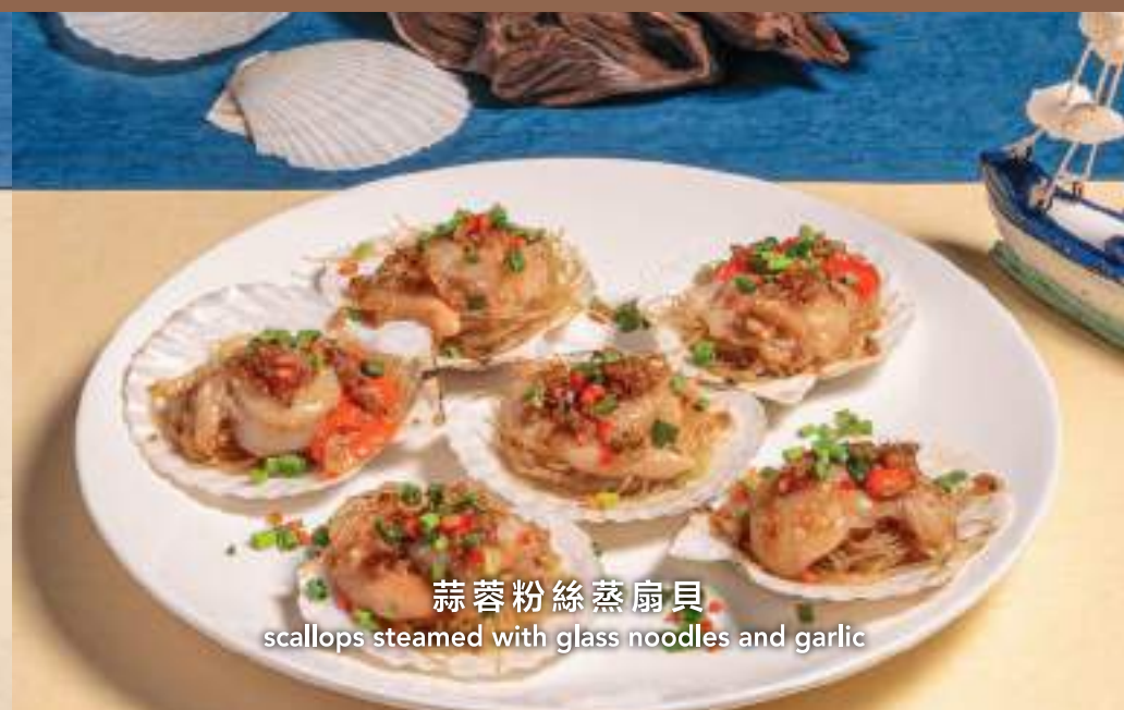
蒜蓉粉絲蒸扇貝 scallops steamed with glass noodles and garlic