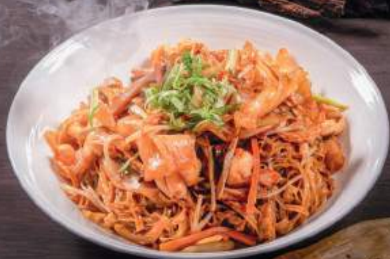
鮑汁花膠海鮮撈粗麵 braised noodles with fish maw, fish lips and dried seafood in abalone sauce