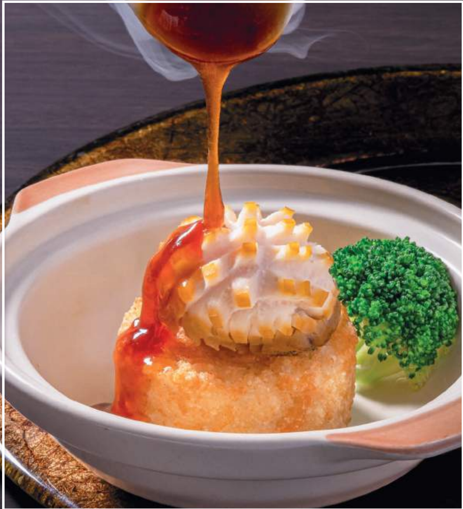
鮑汁砂鍋鮑魚飯 seared rice with abalone and abalone sauce in casserole