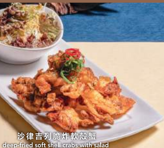
沙律吉列脆炸軟殼蟹 deep-fried soft shell crabs with salad