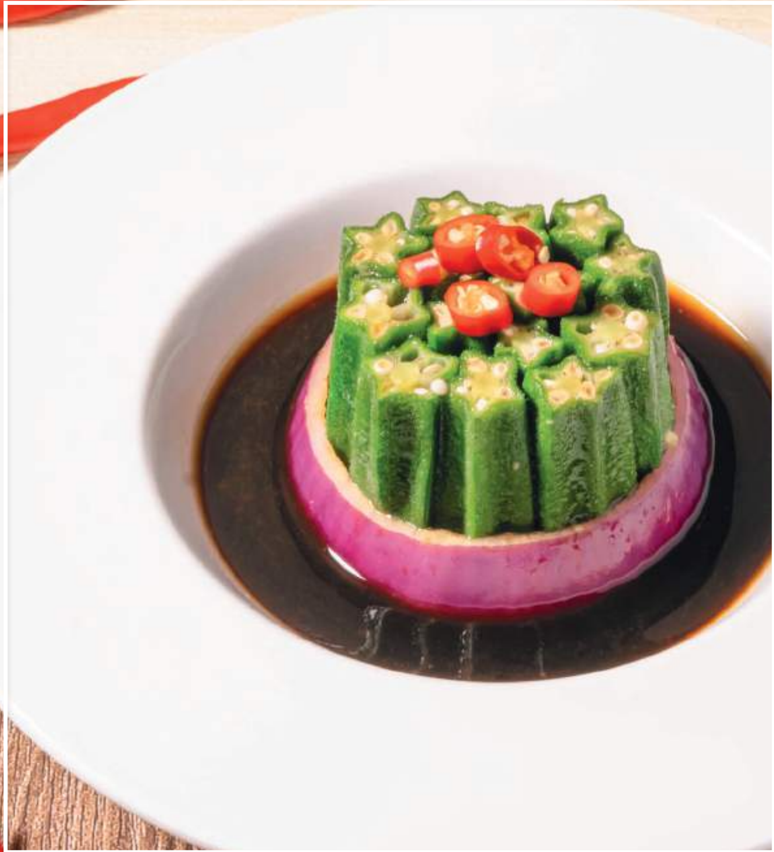
養生醬秋葵 okra with chef's special sauce