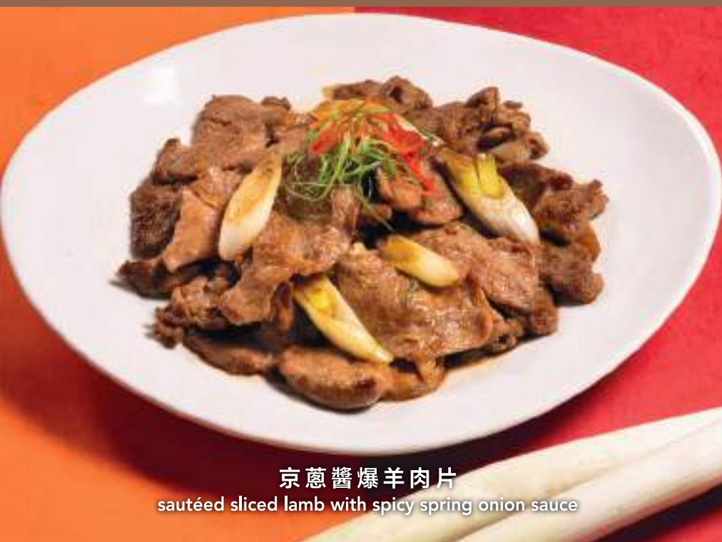
京蔥醬爆羊肉片 sautéed sliced lamb with spicy spring onion sauce