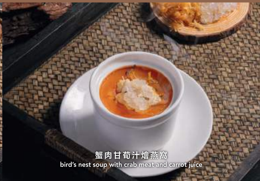
蟹肉甘荀汁燴燕窩 bird's nest soup with crab meat and carrot juice