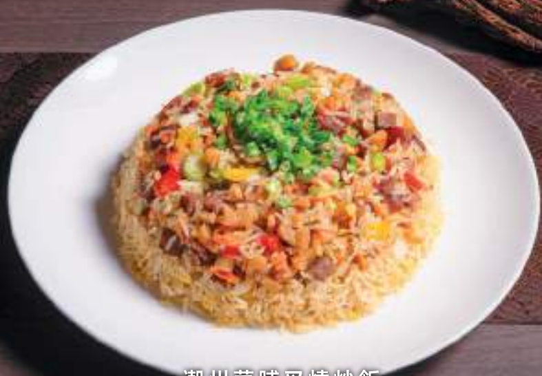
潮州菜脯叉燒炒飯 fried rice with preserved radish and barbecued pork