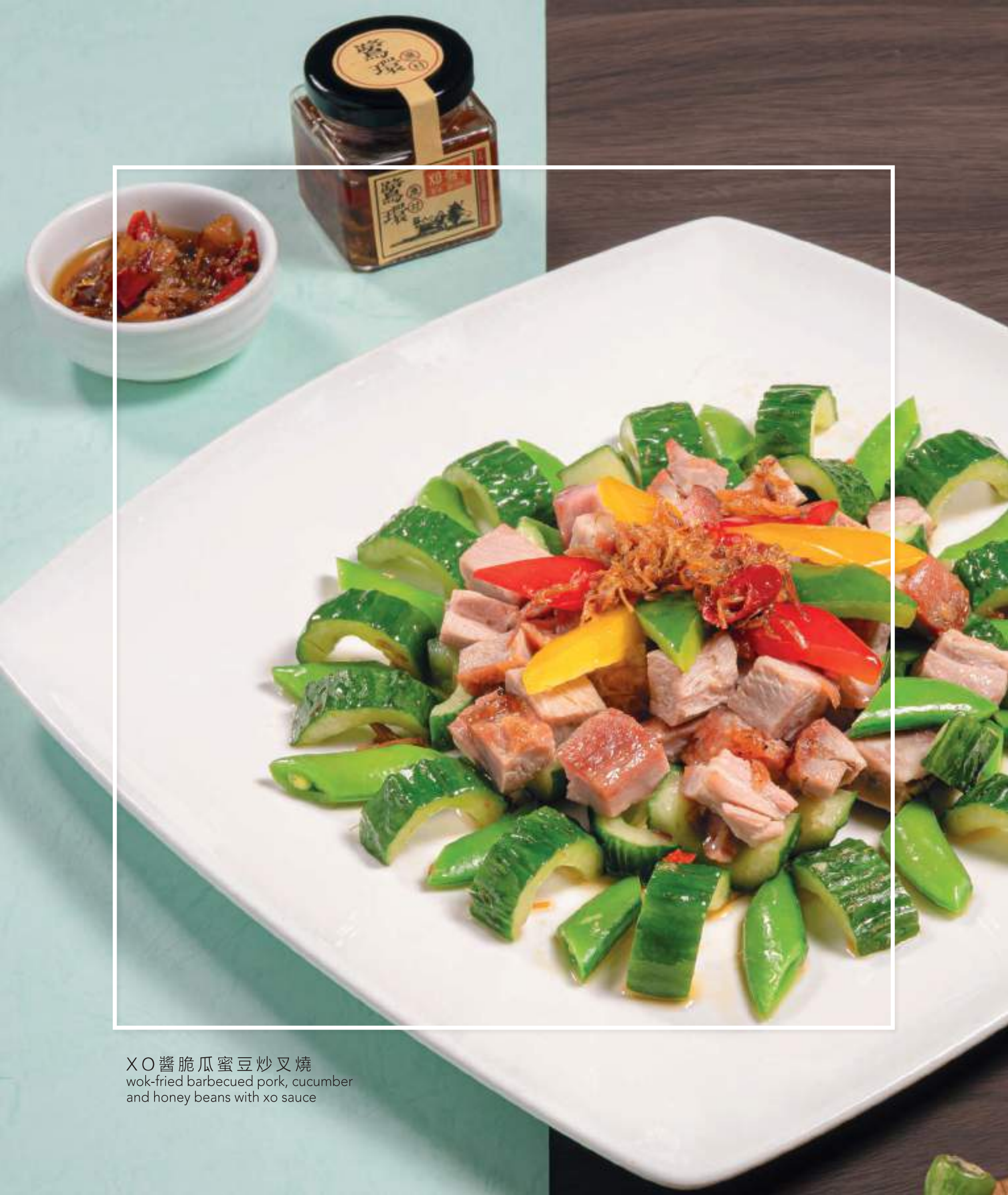
XO 醬脆瓜蜜豆炒叉燒 wok-fried barbecued pork, cucumber and honey beans with xo sauce