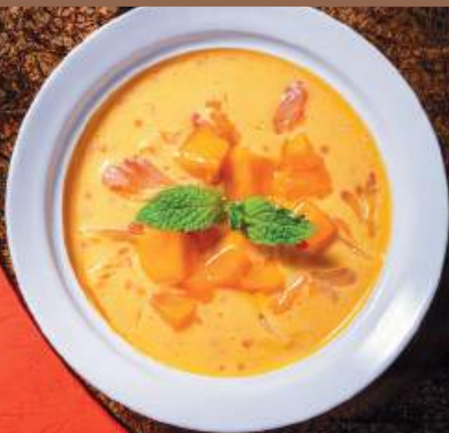
香芒楊枝甘露 chilled mango, pomelo and sago cream soup