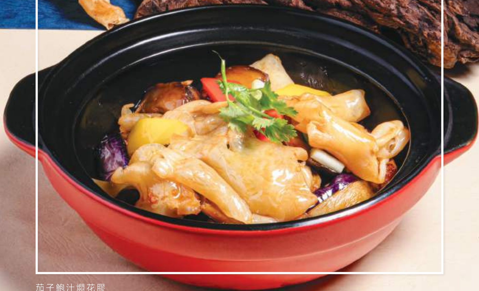
茄子鮑汁燜花膠 stewed fish maw and eggplant with abalone sauce