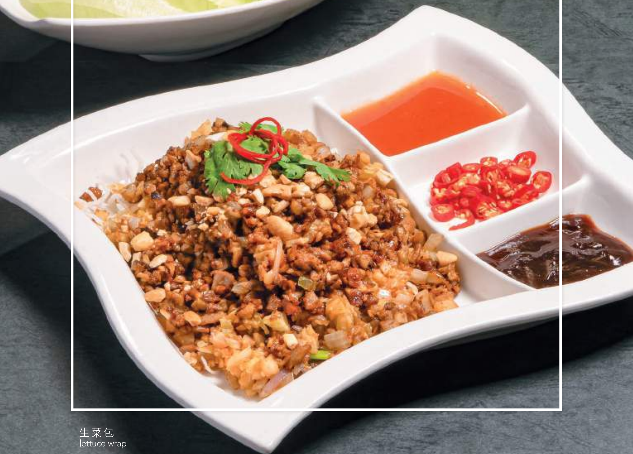
生菜包 lettuce wrap