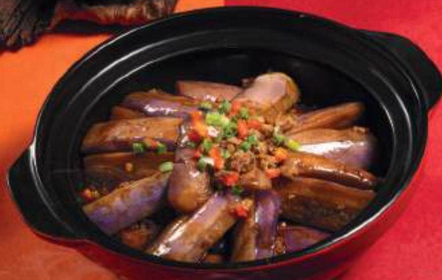
肉末魚香茄子煲 stewed eggplant with minced pork and salted fish in casserole