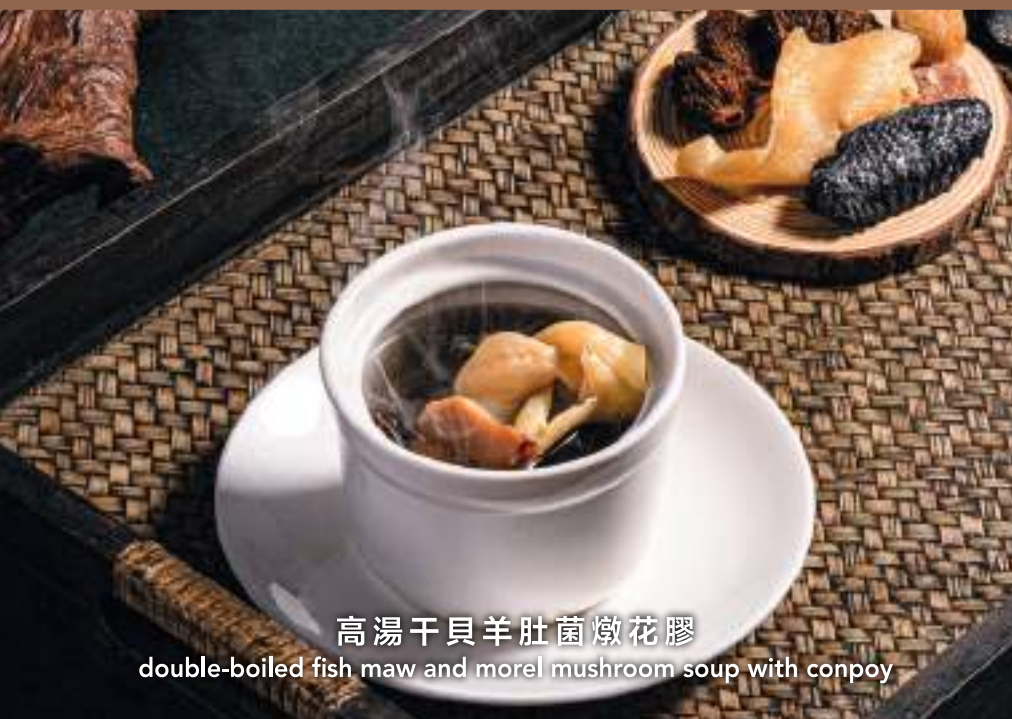
高湯干貝羊肚菌燉花膠 double-boiled fish maw and morel mushroom soup with conpoy