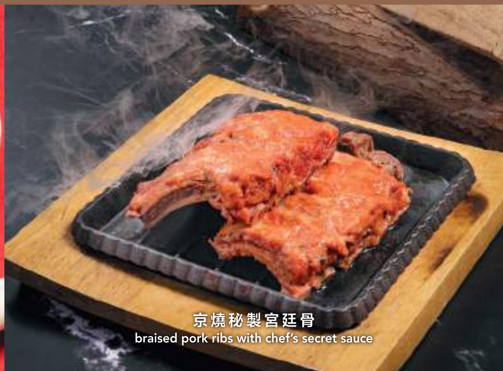
京燒秘製宮廷骨 braised pork ribs with chef's secret sauce