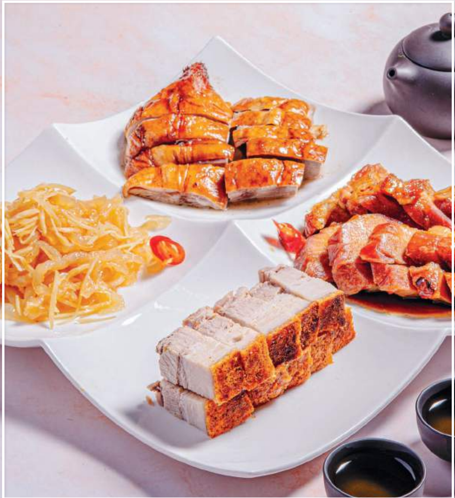
海蜇燒味拼盤 assorted barbecued meat and jelly fish platter