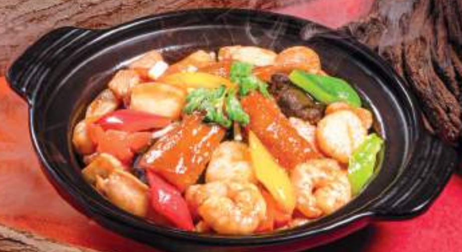
家鄉八寶豆腐煲 braised bean curd, assorted meat and seafood in casserole