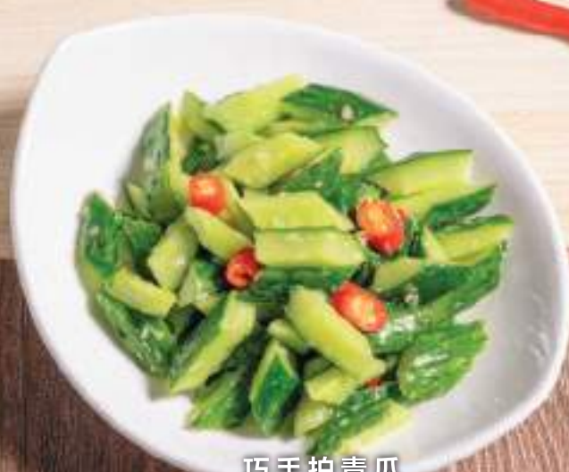
巧手拍青瓜 marinated cucumbers