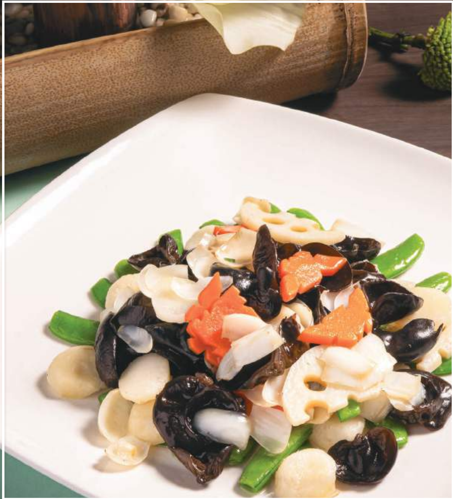
荷塘月色 stir-fried lotus root, lily bulbs with honey beans and black fungus