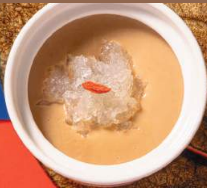
生磨燕窩腰果露 sweetened cashew cream with bird's nest