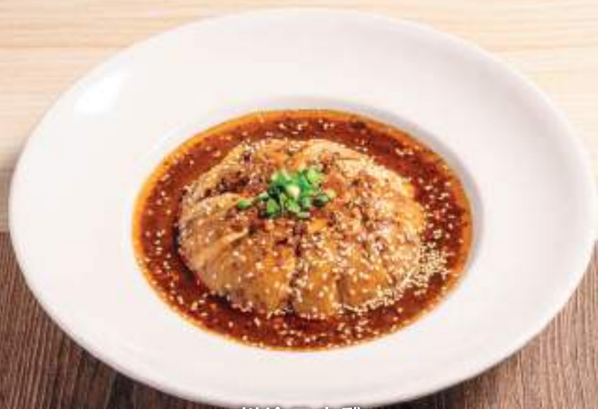
川渝口水雞 szechuan style poached chicken with chilli oil