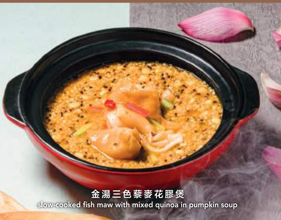
金湯三色藜麥花膠煲 slow-cooked fish maw with mixed quinoa in pumpkin soup