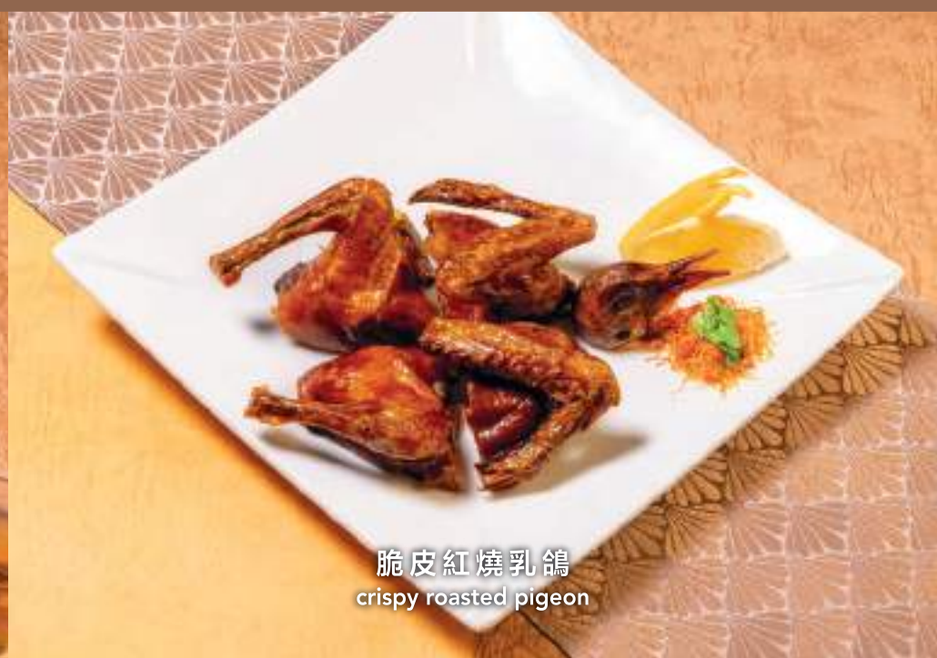
脆皮紅燒乳鴿 crispy roasted pigeon