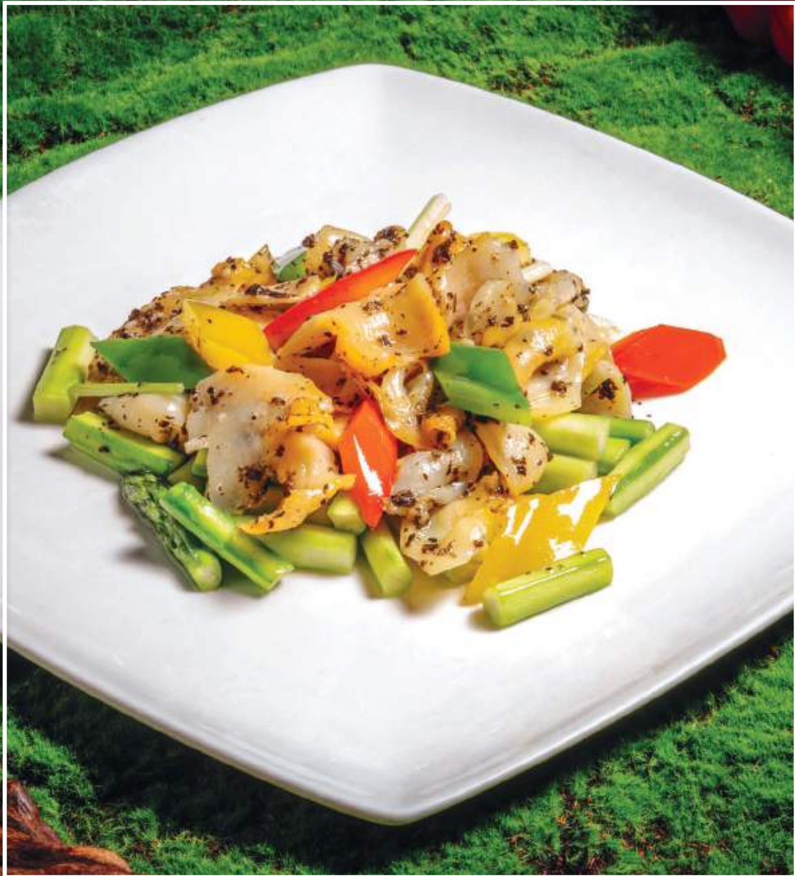
黑松露醬翡翠炒螺片 stir-fried sliced sea whelk and vegetables with black truffle sauce