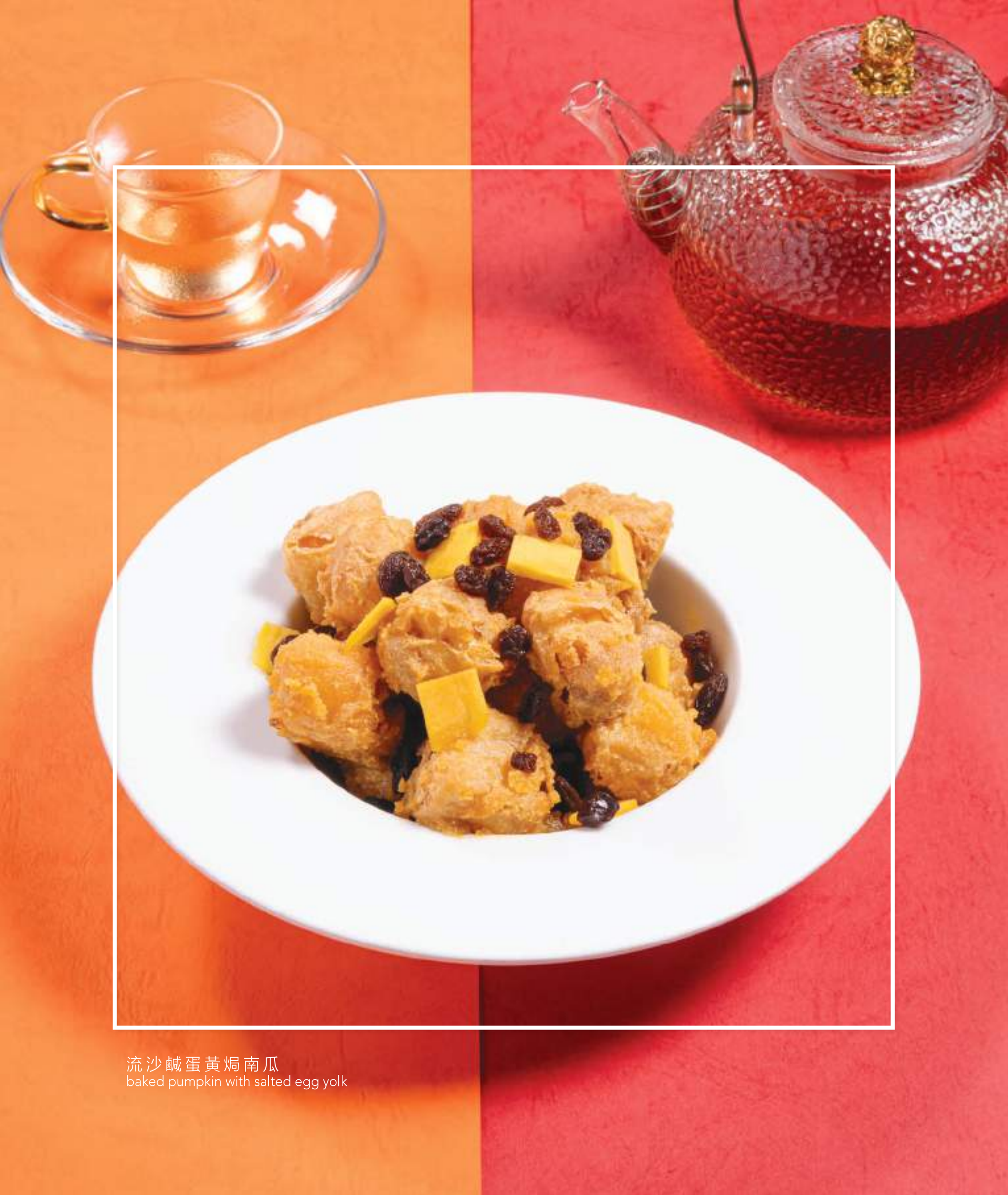
流沙鹹蛋黃焗南瓜 baked pumpkin with salted egg yolk