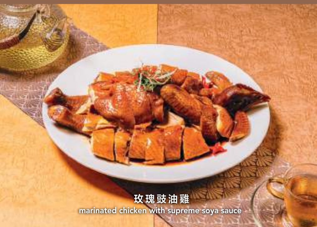
玫瑰豉油雞 marinated chicken with supreme soya sauce