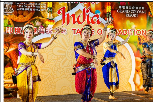
Performance by Hari Om Dance Society from Hong Kong