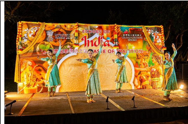
Performance by Sri Shakti Academy of Hong Kong