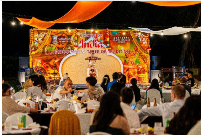
Guest Enjoying at Grand Coloane Resort - Echoes of India event