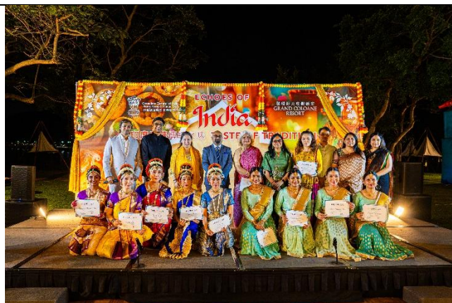
Group photo of all performers and activity partners