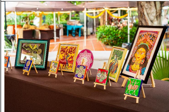
Art Exhibition by Harbour Trio Arts from Hong Kong